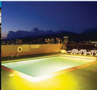
Pool / Spa